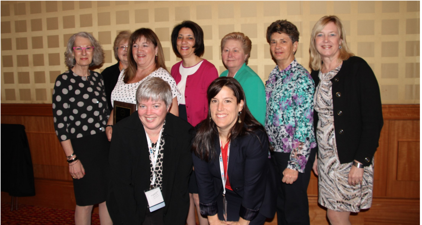
AAWCC Attendees at the 2014 AACC Annual Conference

Each year, the national association of AAWCC recognizes an official chapter and its members who have made a significant contribution to the development of women. This year, AAWCC Oregon received the AAWCC Community College Award for the 2013 Fall Conference. The theme for the conference was Reboot, Refresh, and Restore: Igniting Your Potential . The fall conference is offered annually and is unique in that it is created with leadership and professional development opportunities specifically with Oregon Community College women in mind.