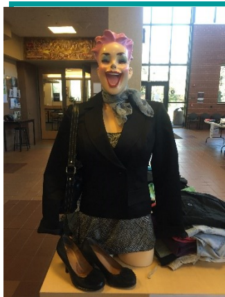
Mannequin dressed to impress

Chemeketa's AAWCC chapter kept a high profile around campus with many activities during fall and winter terms. In December, we helped "Pay It Forward for the Holidays." Colleagues nominated co-workers who were having a difficult time and could use some help. We asked for donations to brighten the holidays and raised enough funds to purchase items for all the families in need.