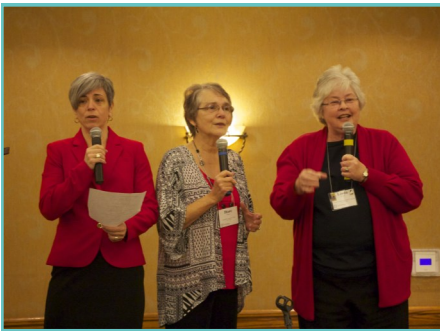
The Conference Chair Quartet Minus One opens the event.