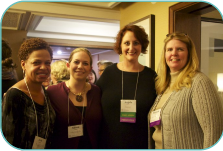
Participants enjoy a welcome reception prior to the event.