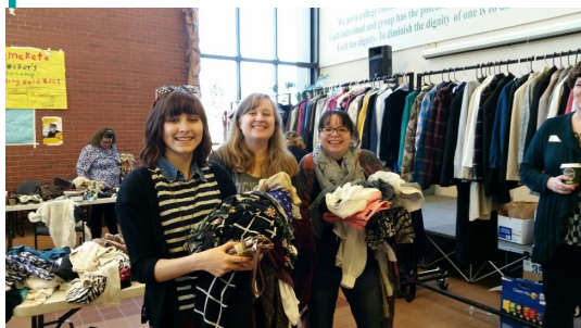
Happy students at $1 per item clothing sale

January marked the beginning of a new year resolution to "Clean Out Closets and Donate." Our chapter organized a college-wide clothing drive for an AAWCC sponsored student sale that was held on February 13. All donated items were sold for $1. There were a record number of donations this year and the fire marshal told us we had to clean out our storage area because there were too many bags! Over 600 items were sold at the one-day event. The students loved it. Volunteers helped staff the sale during the day. Proceeds will be used for scholarships and chapter activities. Next year we intend to combine the clothing sale with college Earth Day activities.