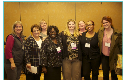
Women from all over the country participated in the AAWCC National Conference.