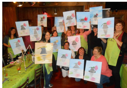
Paint night at Chemeketa