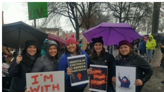
Mt. Hood women at the Portland Women's March.

Several members of the Mt. Hood chapter participated in the Women's March in Portland on January 21.