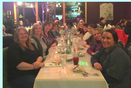
AAWCC-Oregon Board of Directors